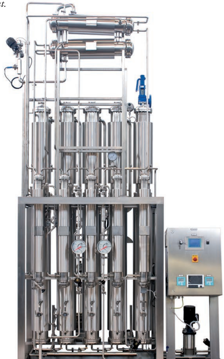
Pharmastill MS 505 HPS increasing of condenser height