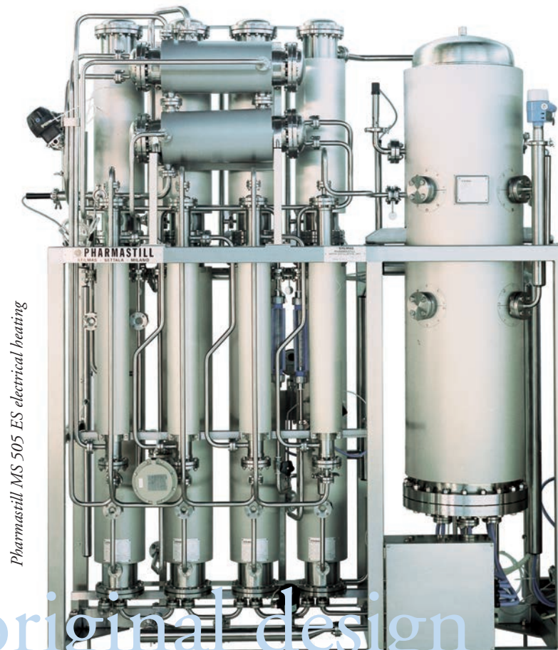
Pharmastill MS 505 ES electrical heating

The general construction design, coupled with the described decontamination process, ensure a very high flexibility in equipment layout, together with an extremely limited space needed for maintenance.