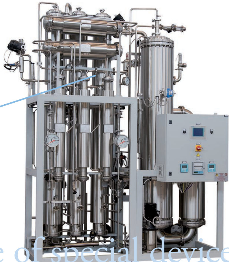
Pharmastill MS 705 COMBI: simultaneous production of WFI and PS