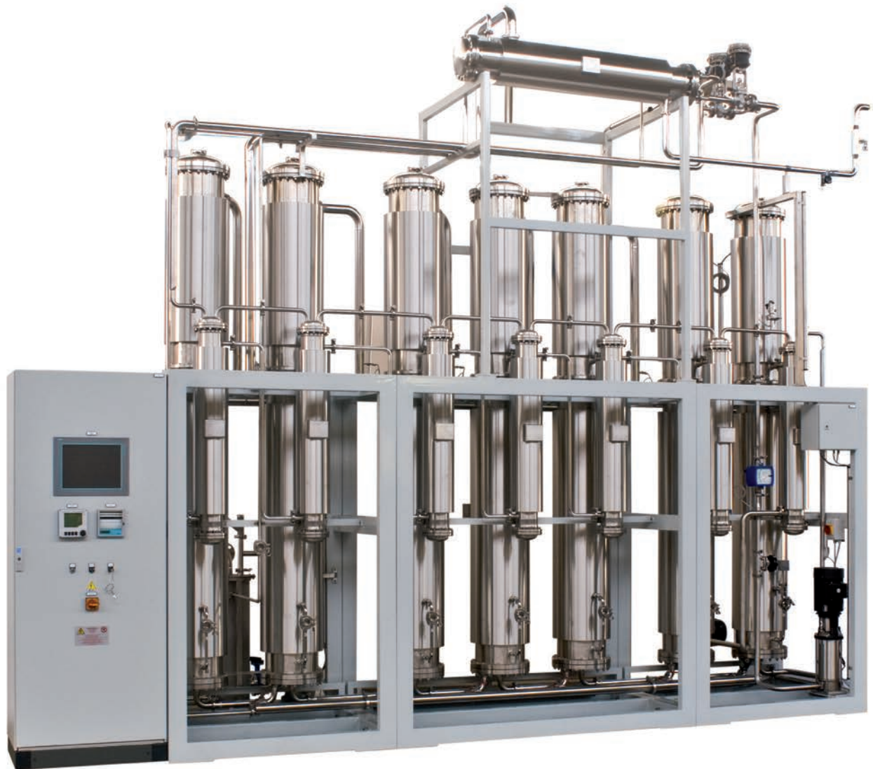
Pharmastill MS 704 HPS: seven effects and no cooling water needed

In addition, Stilmas Pharmastill is equipped with individual and separate pre-heaters for each effect, independent from the evaporators/condensers, thus achieving the highest sensible heat recovery, and finally the best energetical efficiency.